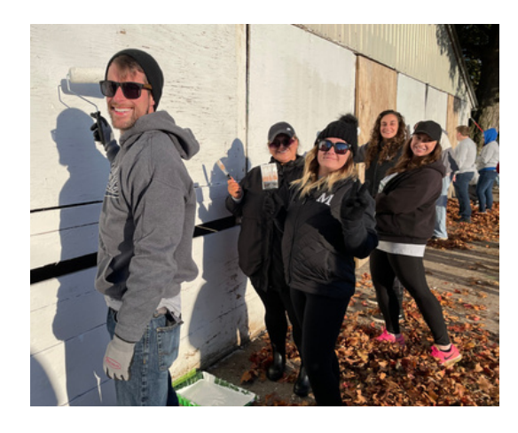
Michigan One employees painting the Livestock Barn at the Ionia Fairgrounds